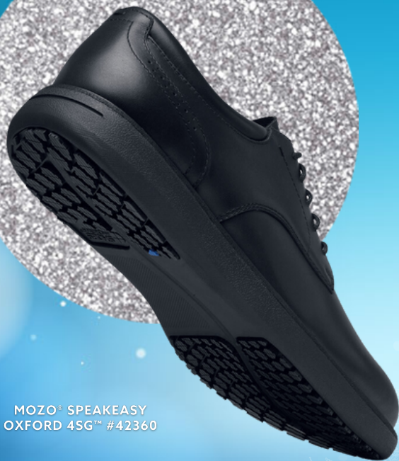
MOZO® SPEAKEASY OXFORD 4SG™ #42360