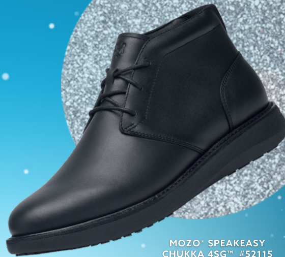
MOZO® SPEAKEASY CHUKKA 4SG™ #52115