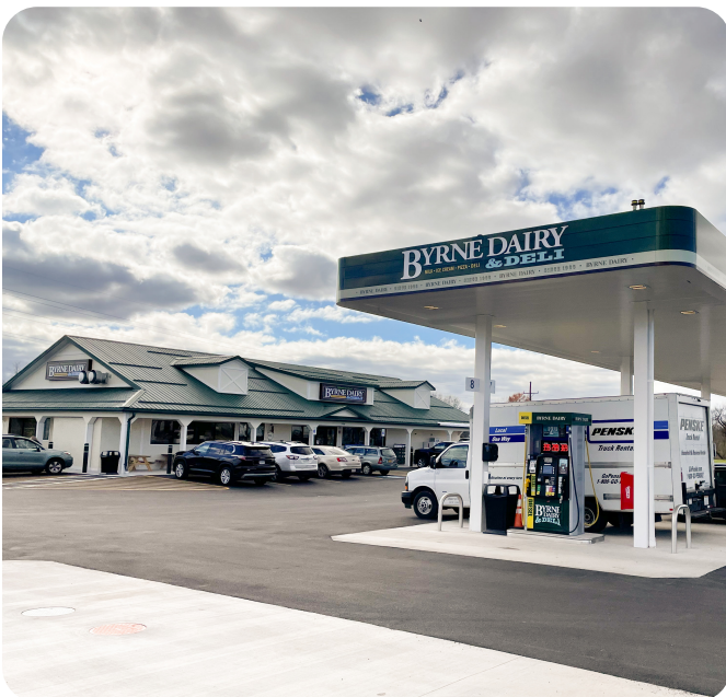
#154 WATERLOO STORE OPENING

On November 15 th , we had the annual Fall General Manager Luncheon at Ventosa Vineyards in Geneva. We got together to celebrate and thank our General Managers and Operation Managers for all the hard work they have put in this year.