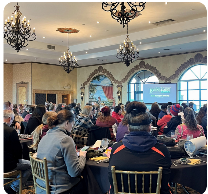
ANNUAL FALL GENERAL MANAGER LUNCHEON