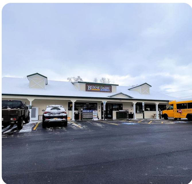
#157 WALWORTH STORE OPENING

The new Walworth Store #157 opened on January 15 th . Thank you to all the stores who helped train our new employees and to our Walworth employees for making it a successful opening!