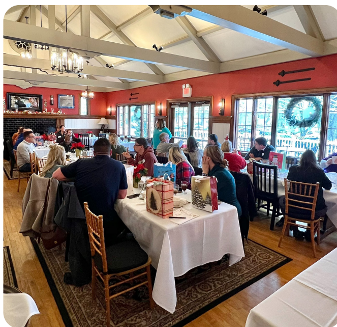
OPS CHRISTMAS LUNCHEON

On December 20 th , we had the annual Ops Christmas Luncheon at the Springside Inn. We got together to celebrate and thank our District Managers and Operations Team for all the hard work they have put in this year.